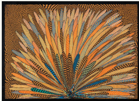
Bird from Paradise

Ball Point Pen, Coloured Pencil 12" x 16.5"